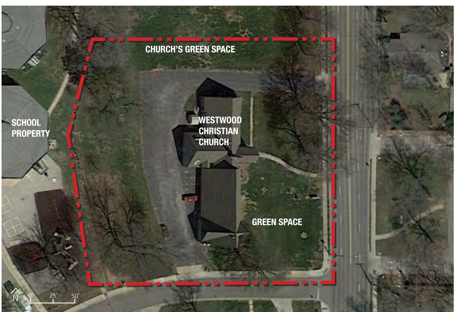
5050 Site Boundary