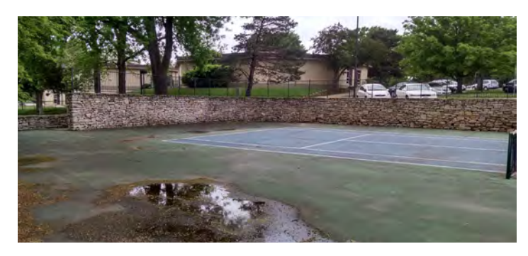
Storm Water Damaged to Tennis Court