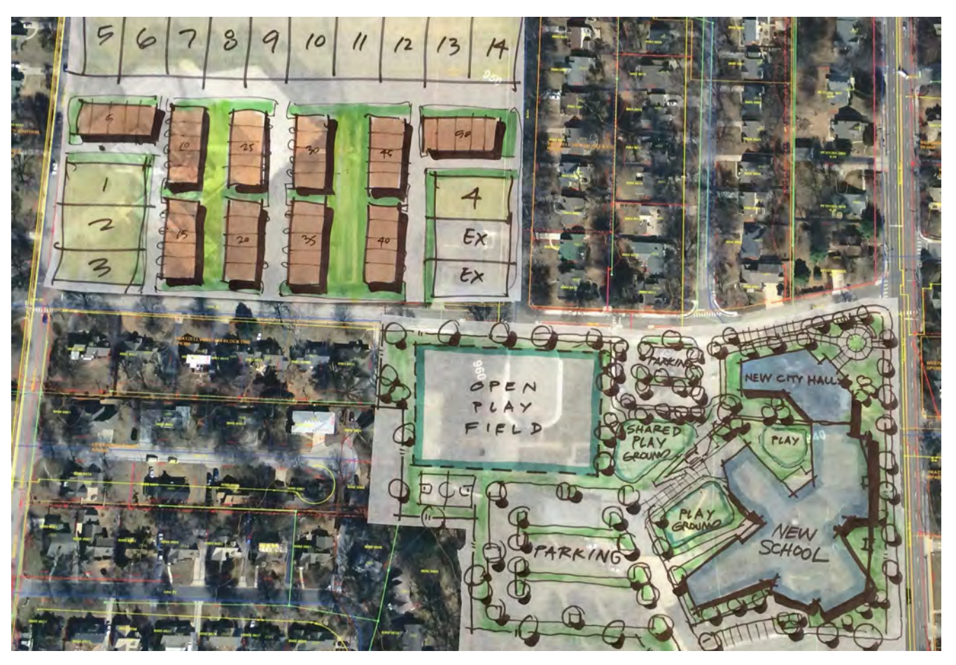
Lead With Housing Concept Drawing