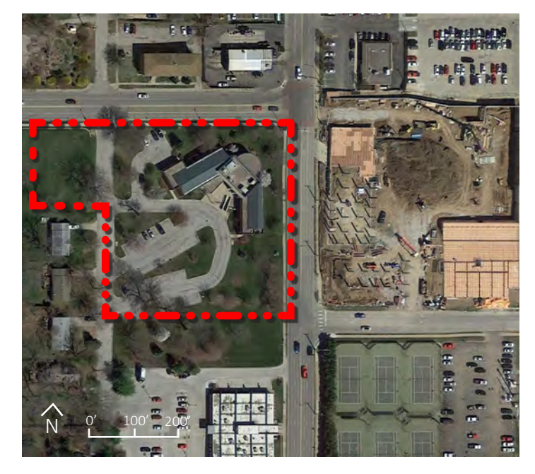
City Hall Site

The existing Westwood City Hall facility is located on the southwest corner of the intersection of West 47th Street and Rainbow Boulevard on about 2.41 acres of land. This one-story building includes space for the Police Department, City staff offices, a flexible room for conducting Municipal Court and City Council meetings, and community meeting rooms with a small kitchen. While the building in some ways addresses the primary intersection through its placement, its entry is oriented towards the parking area, and lacks a strong connection with West 47th Street or Rainbow Boulevard. A major redevelopment project, Woodside Village, is under construction across Rainbow Boulevard to the east, and is already transforming the appearance and visual character of this area.