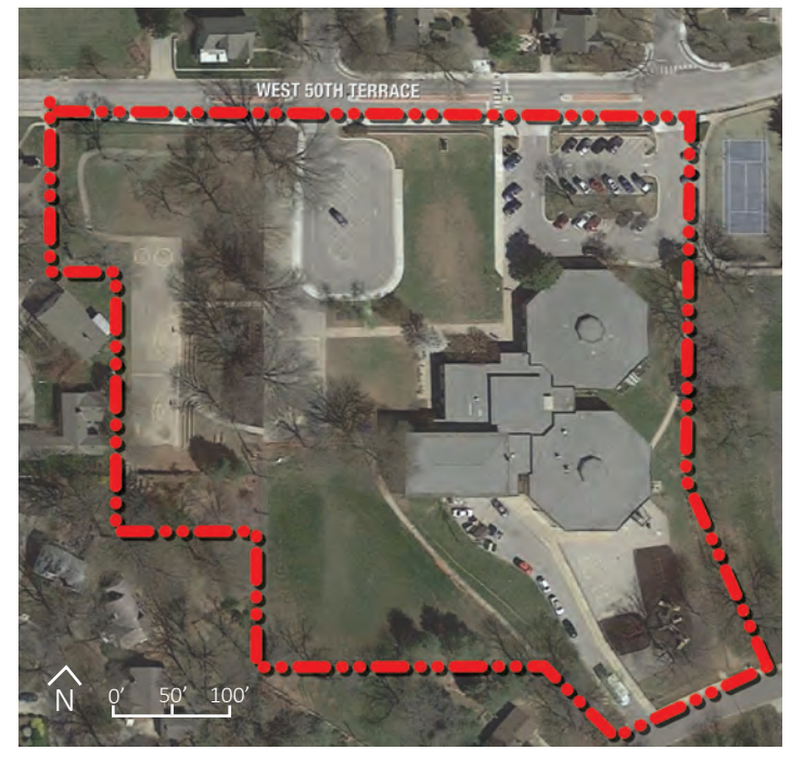
Westwood View Elementary School