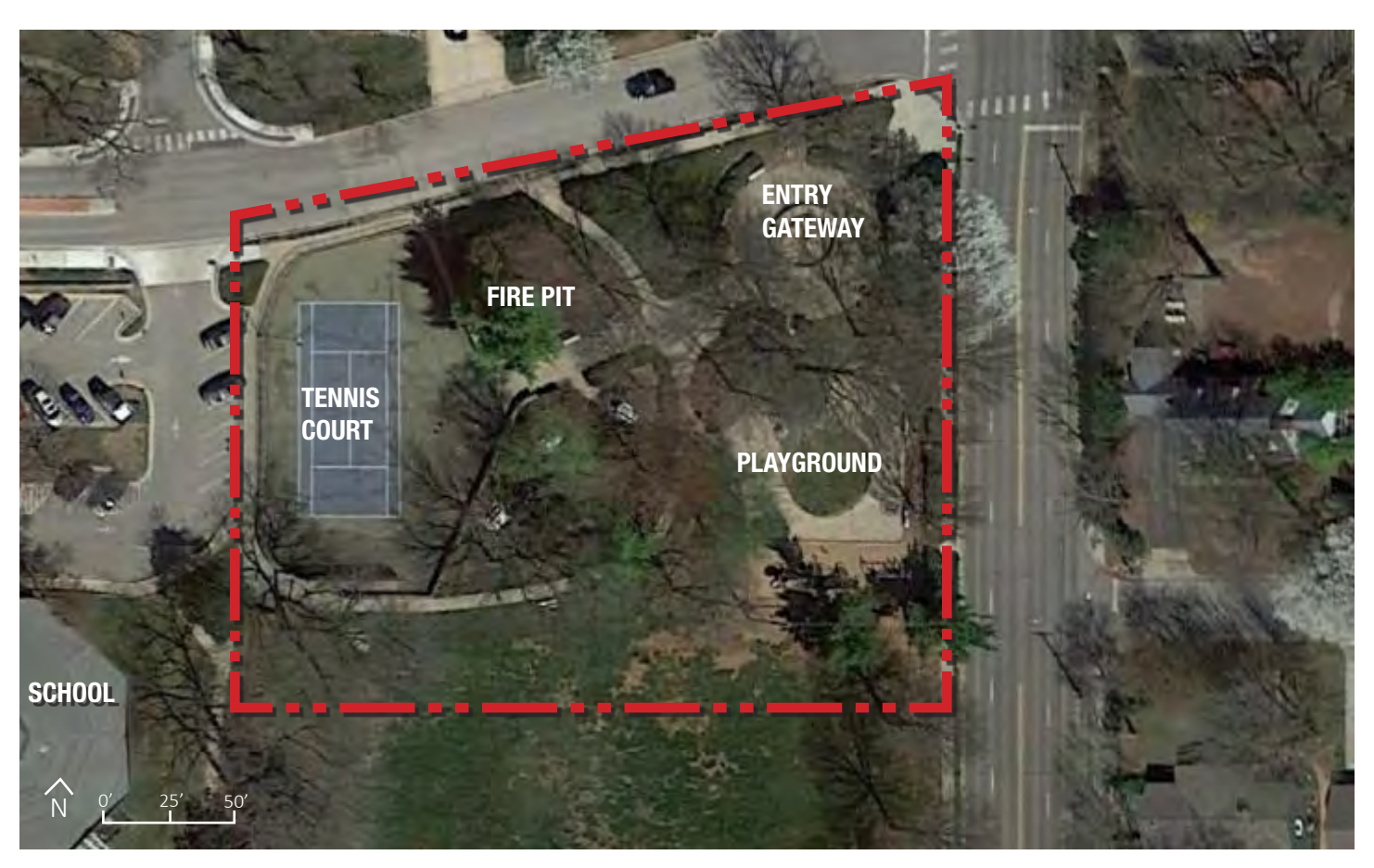
Dennis Park Site Boundary