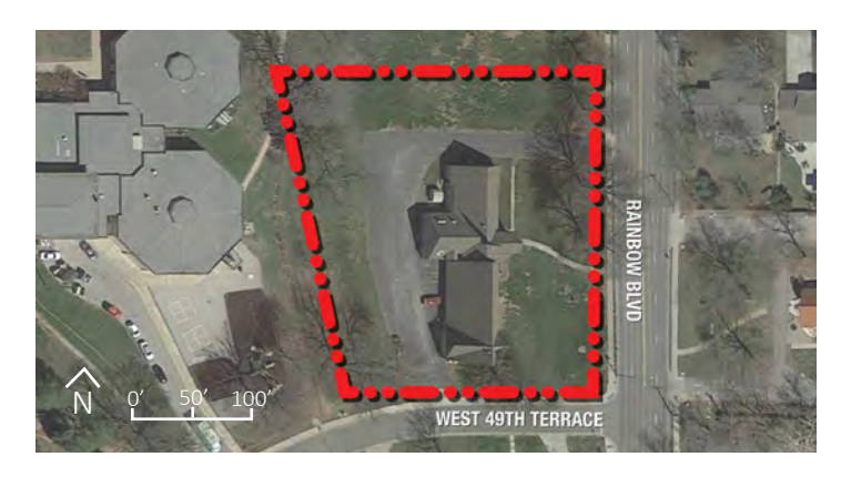
5050 Rainbow Boulevard