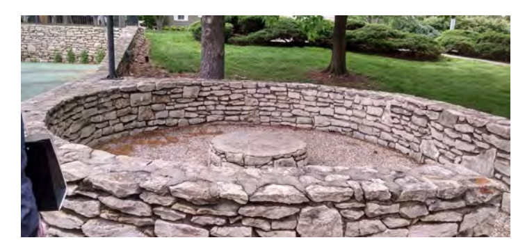
Fire Pit for adjoining Ice Rink

Dennis park is used by Westwood View Elementary School children, as witnessed on the Panel's site visit, even though the school has a fenced-in playground near the school building. The mayor expressed interest in relocating the playground away from Rainbow Boulevard to where the tennis court currently sits. There is not a fence separating the park from the busy Rainbow Boulevard to the east. The tennis court was built at the base of the slope with the intention that in the winter, ice melt could be caught on the tennis surface and used for an Ice Rink. Instead, the stormwater has damaged the tennis court's surface.