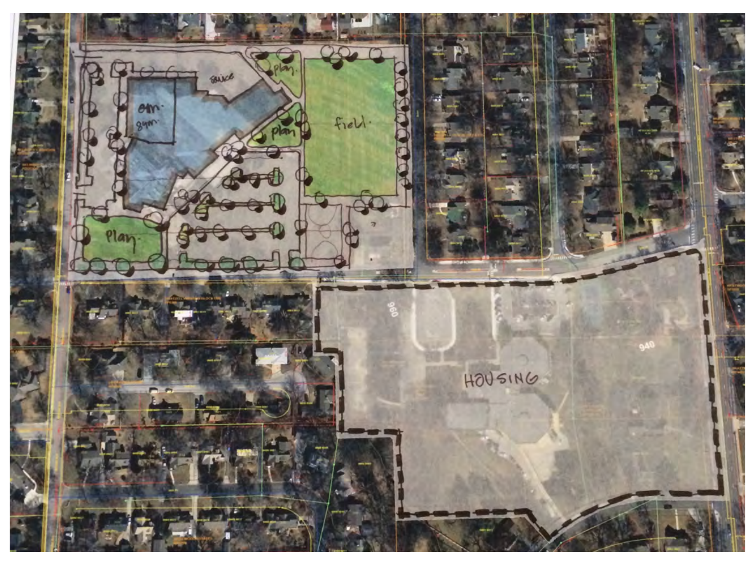
Lead With School Concept Drawing