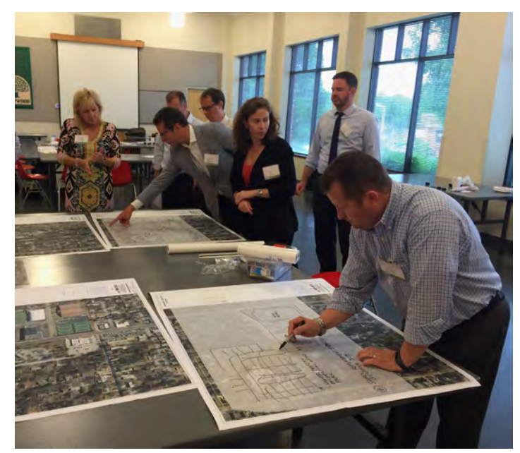
ULI Panelists working on concept drawings.

While brainstorming design aspects, the panel opted to look at the three sites together rather than separately, enabling potential future land swaps. Many options were considered while the Panel brainstormed. The final two designs were centered on what the Panel found most important, the school, housing and park space.