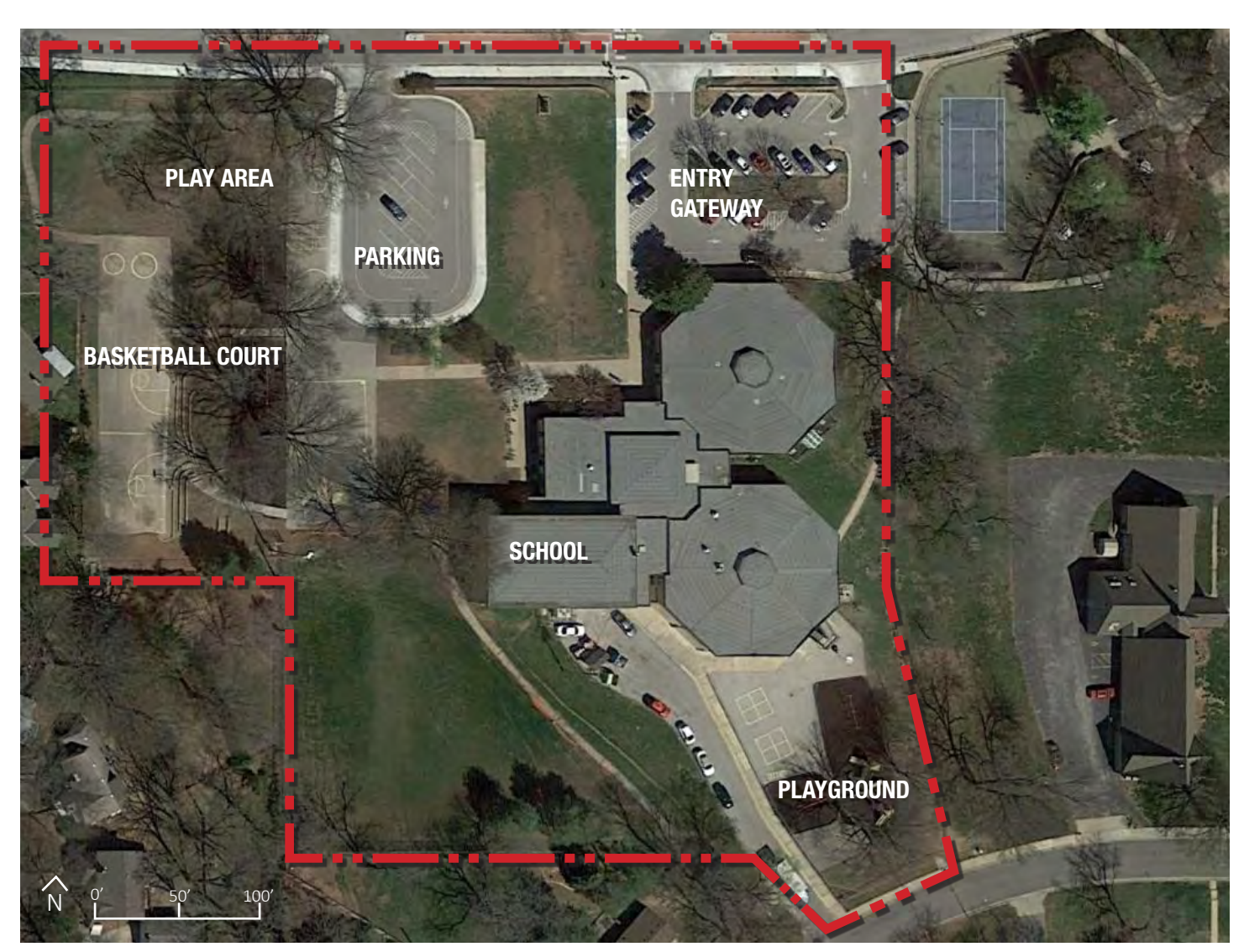
Westwood View Elementary Site Boundary